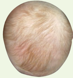
After STARband Treatment

to see what progress has been made. Typically, the decision to discontinue treatment is made at the time the baby starts to outgrow the band. At that time, the caregivers, physician, and other professionals will check the progress and decide if the band has corrected the head shape to a point where continued treatment is no longer necessary.