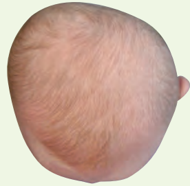
Before STARband Treatment

The practitioner will document your baby's head shape throughout the treatment program with measurements, or clinical pictures. Periodically, the documentation will be compared to the original measurements and pictures